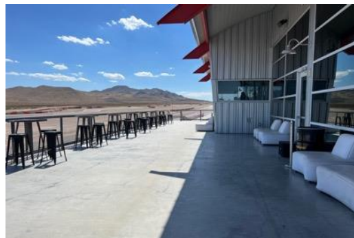
Exterior Terrace – 2500 sf – 200 guests