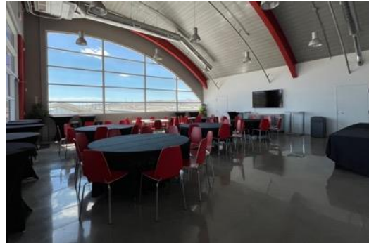
Champions' Room – 1156 sf – 130 guests