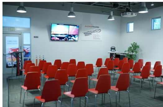
Briefing Room – 900 sf – 100