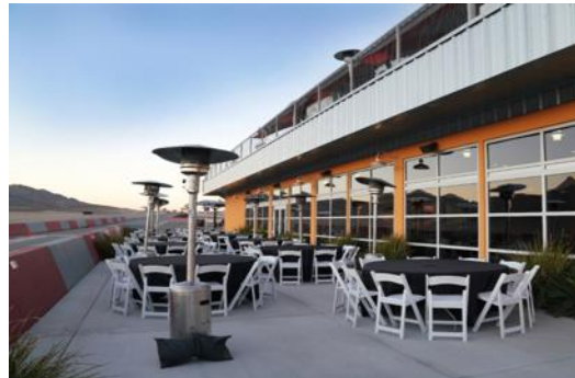
Exterior Terrace – 2500 sf – 200 guests