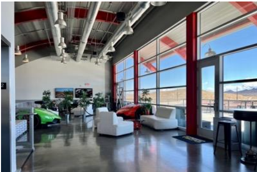
Interior Terrace – 900 sf – 80 guests